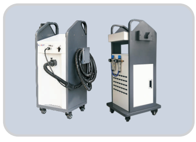
New Idea for dust-free sanding National patents