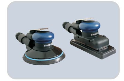
Multi-functional sanding pad, Compatible with various sanding paper.

Large volume dust container, making cleanup easier. Trolley design, take it everywhere you need.